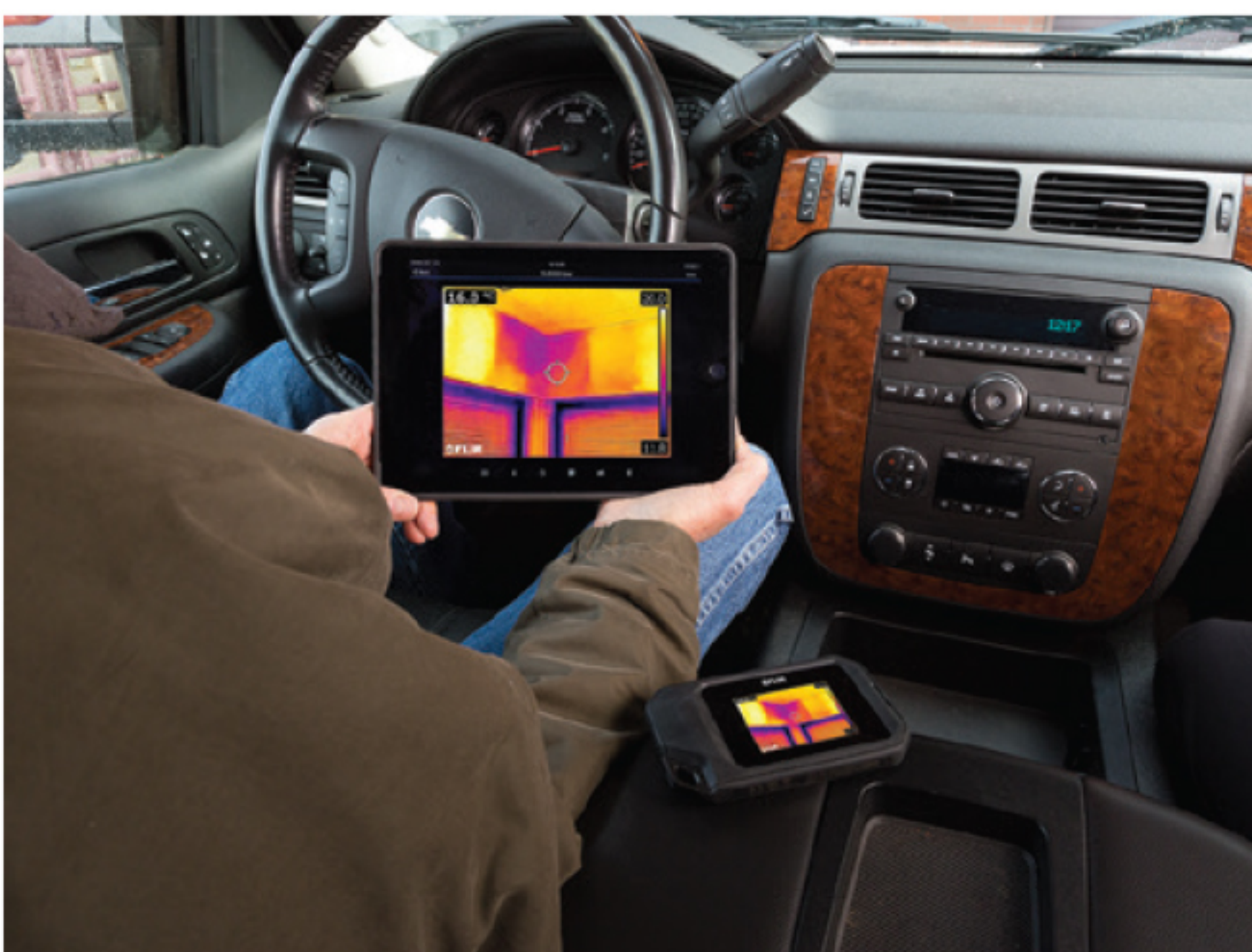
Upload images to FLIR Tools over Wi-Fi