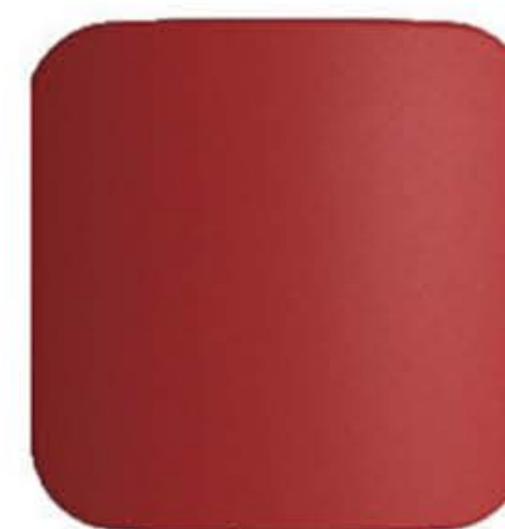
Locking Button Top View

For More Information Please Contact LineStar Directly