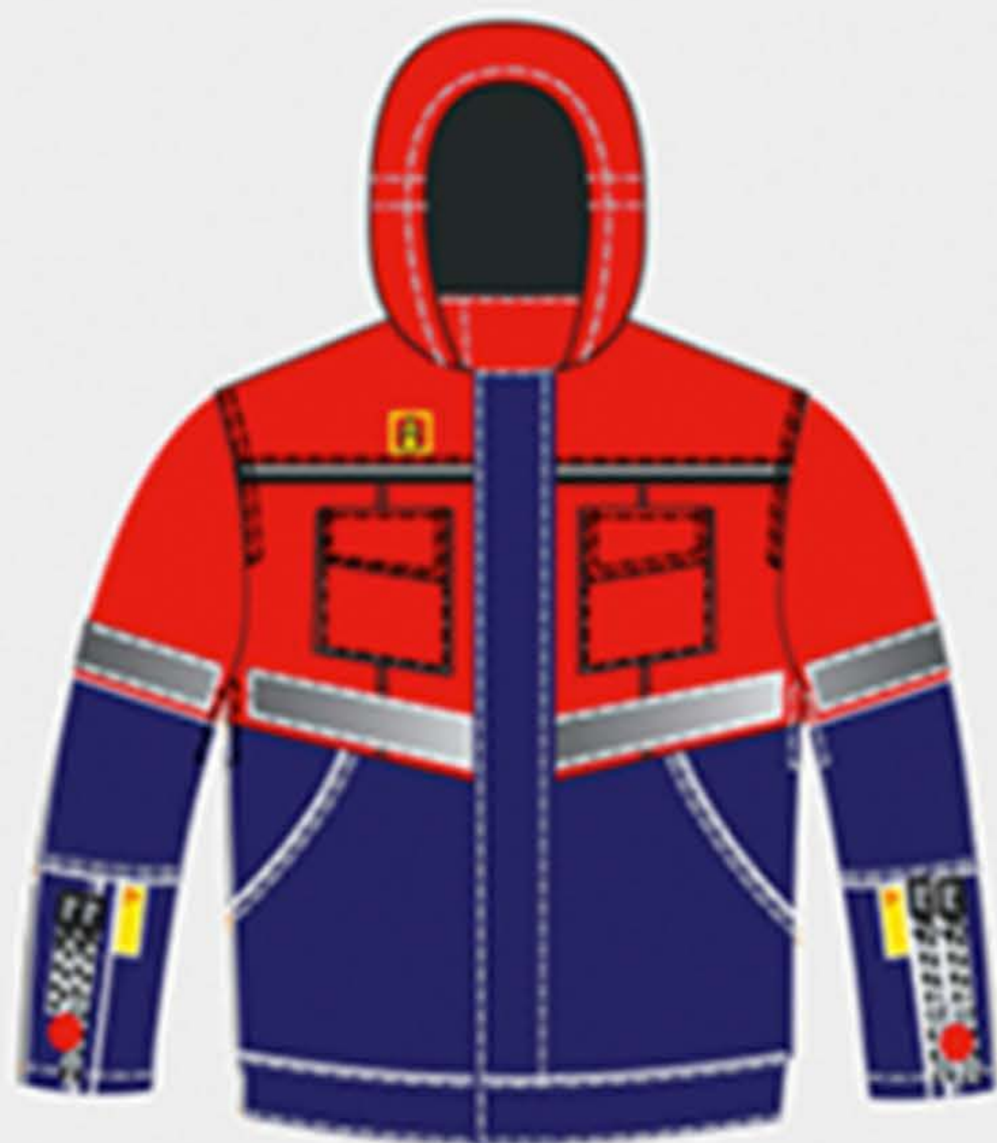
Lightweight jacket and bib-and-brace

Equipotential bonding leads covered by sleeves and trousers edges