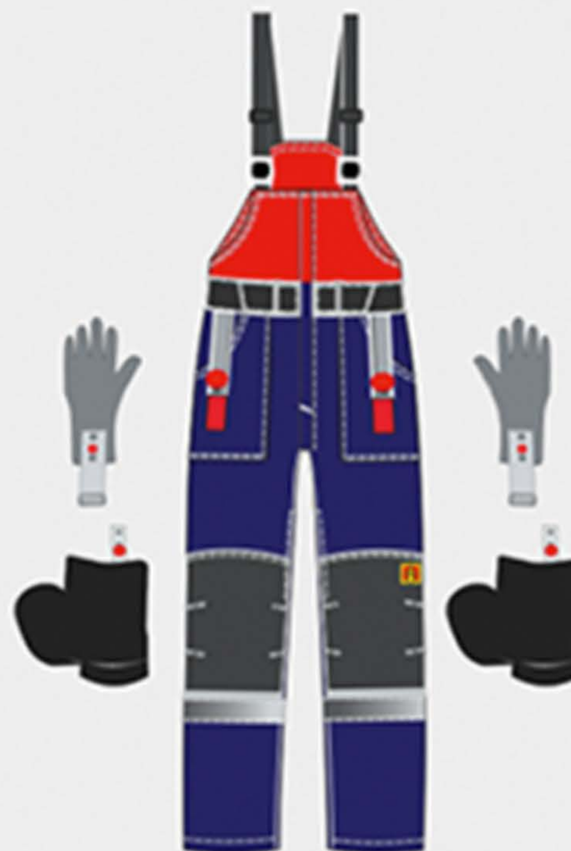
Equipotential bonding leads covered by sleeves and trousers edges

Boots with air valves and fabric inserts