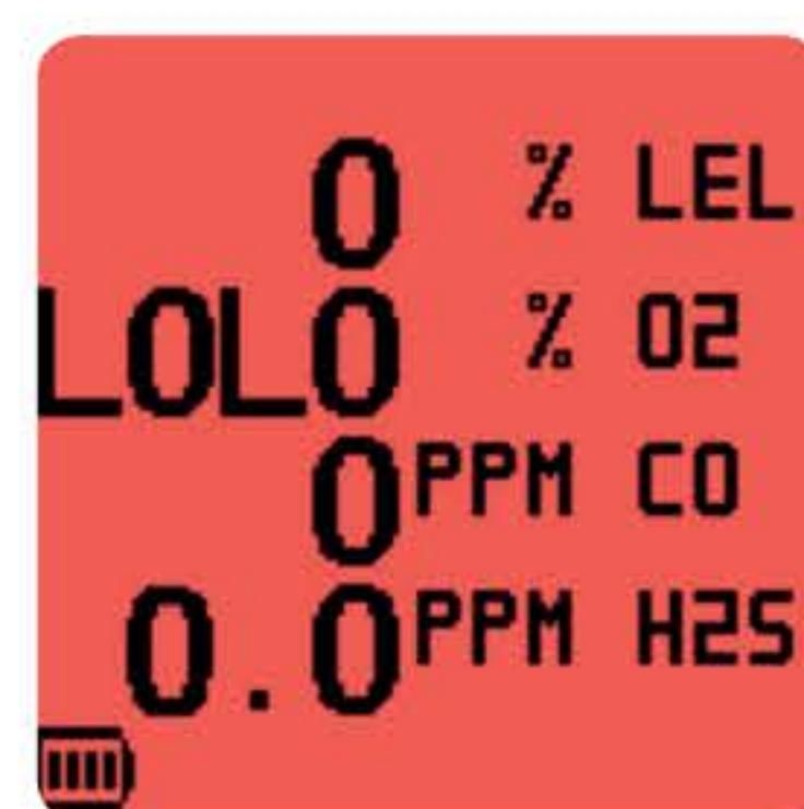
Red display in alarm conditions