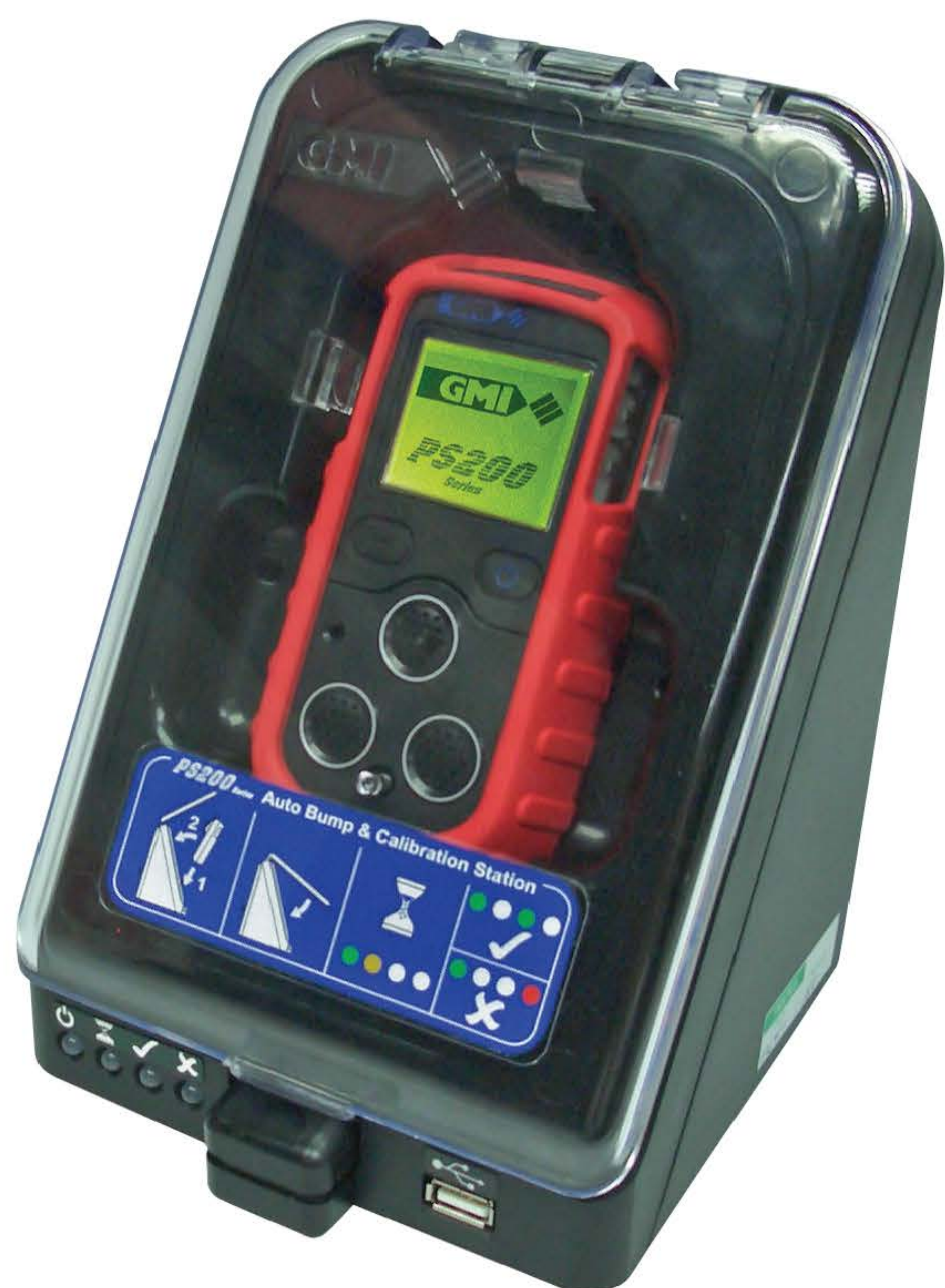
Coloured 'rubber boot' for multi-site or multi-application working (7 colours available)

To complement the Personal Surveyor product line, Teledyne has developed a compact, robust and easy to use Auto Bump & Calibration Station that can provide full bump and calibration options. Data transfer is facilitated using a USB memory stick with Standalone software that is simple to set up and customise based on end users' specifications. Standalone, PC, and ethernet versions are available.