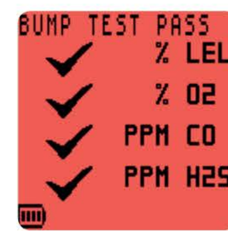
Configurable bump options