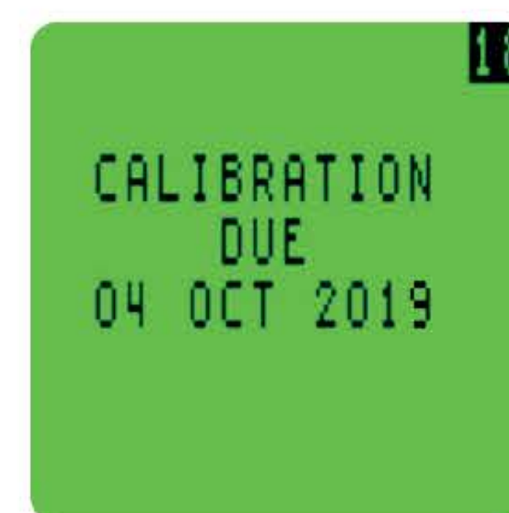
Configurable calibration options