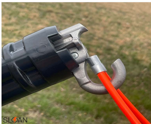
The adapter slides into the shotgun stick retractable hook.